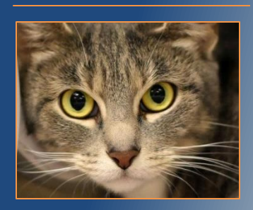
Free Cat Adoptions 12/1-12/31, Noon-7 p.m.

All events are held at 2741 South Western Avenue. Details: bit.ly/caccevents