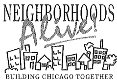
Christine Raguso Acting Commissioner