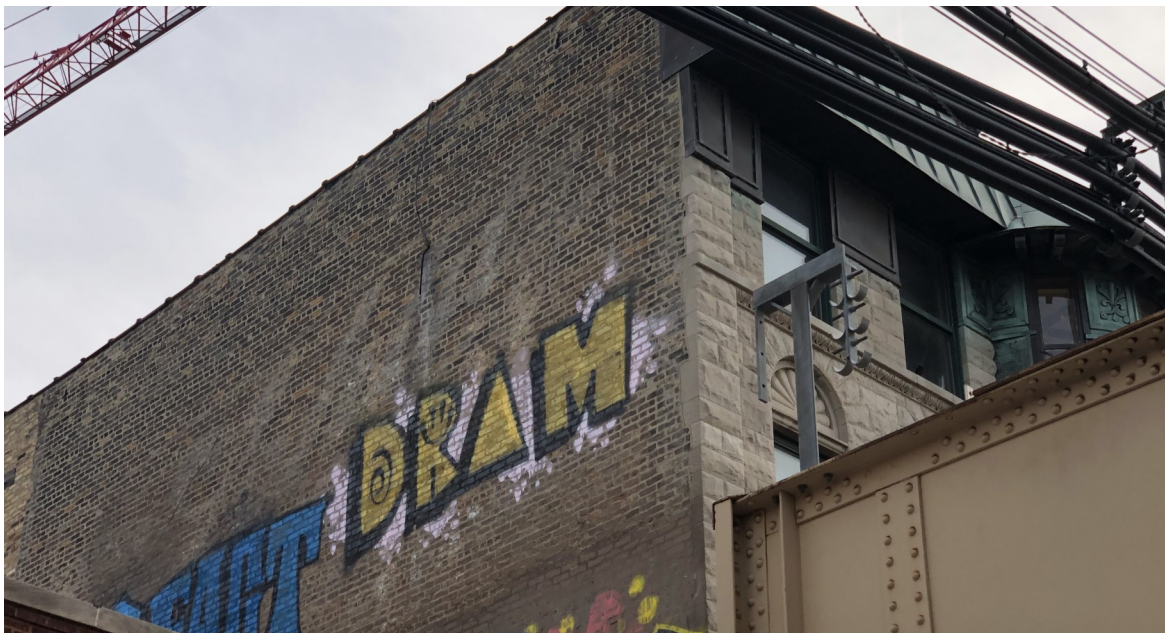
A “ghost sign” shows the recognizable curves of the cursive Schlitz font used by the company (visible above the graffiti).