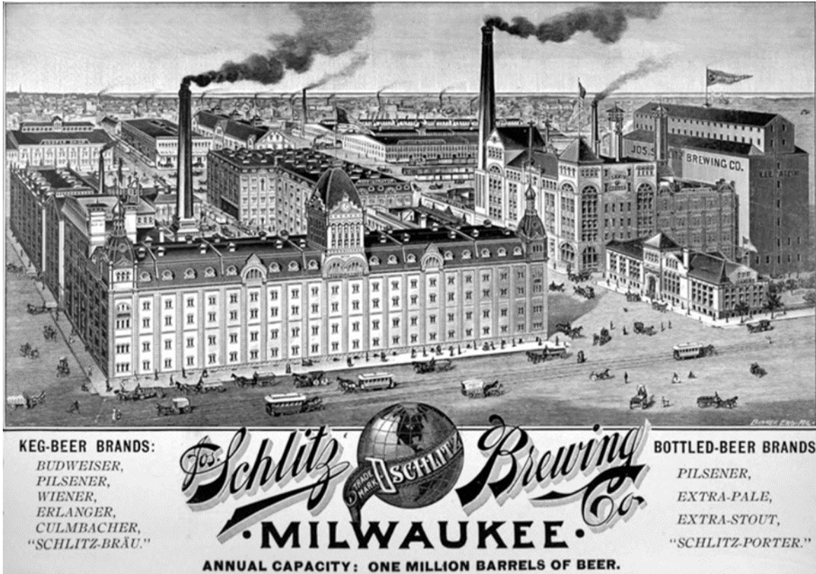
An 1892 Schlitz Brewing Company ad with an illustration of its Milwaukee manufacturing facility. Also visible is the Schlitz font logo and the new Globe logo, first used in 1892.