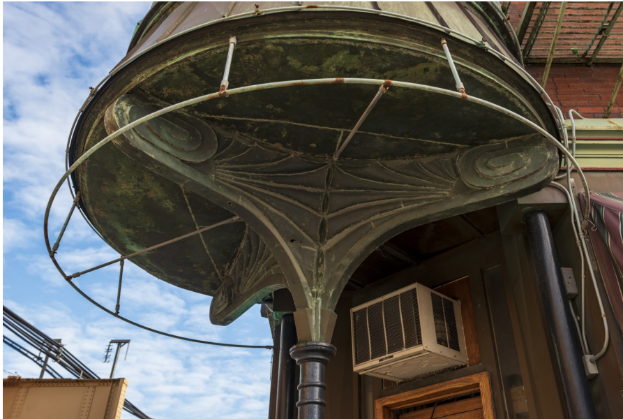
At the corner, a single cast iron post sprouts modillion brackets featuring a webbed pattern.