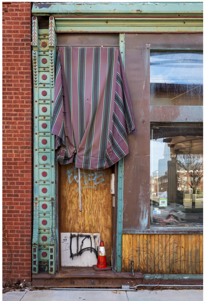
Cast iron structural members frame the original storefront opening including a decorative pier, lintel, landings, and sills. Photo of the north elevation.