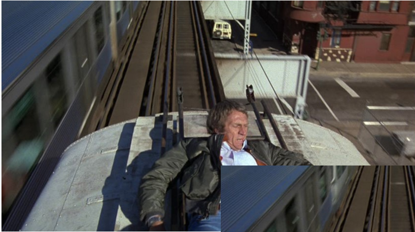
Actor Steve McQueen struggles atop a moving elevated train in the 1980 movie The Hunter with 1393-1399 West Lake Street visible in the background (at right).