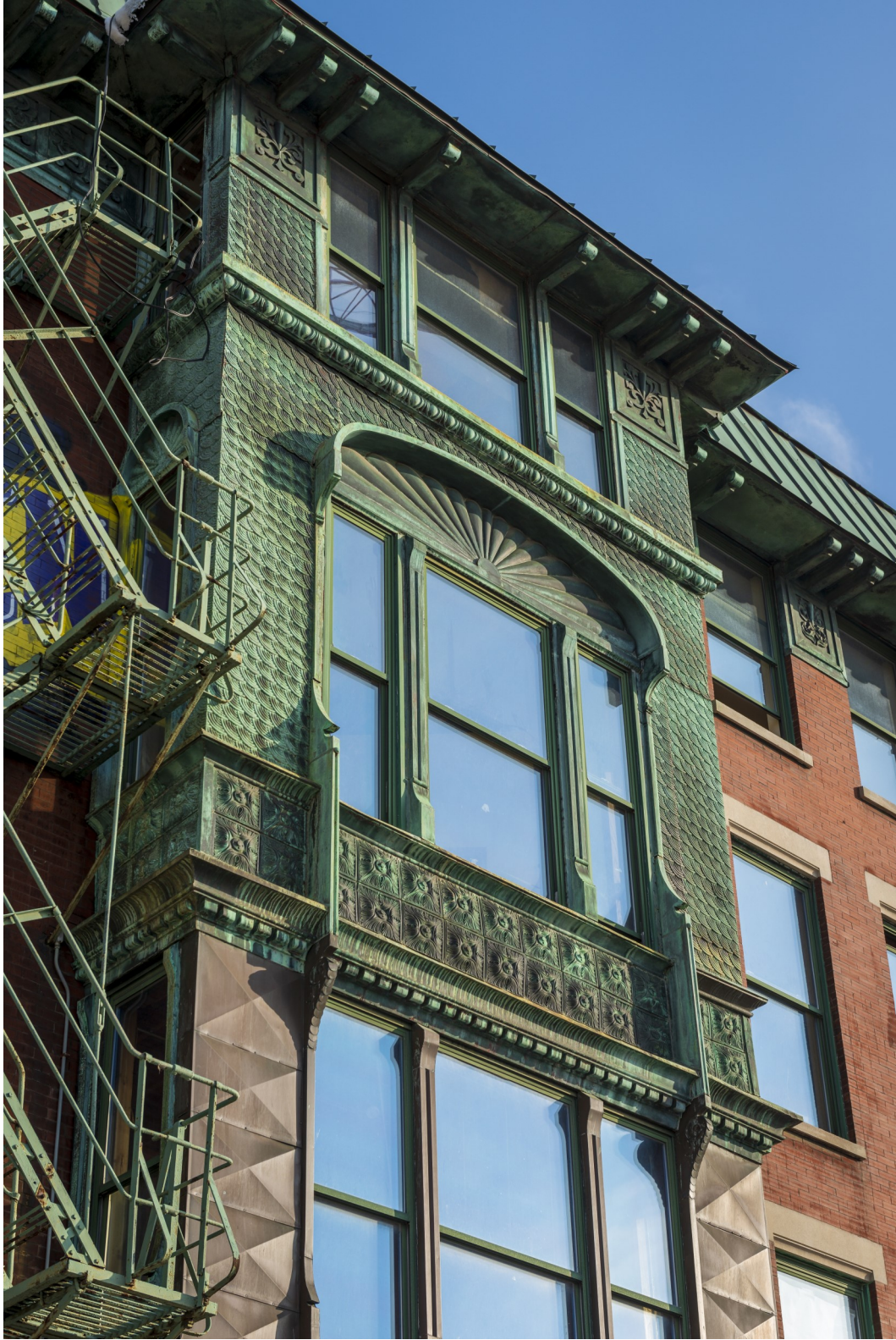
The bay window at the west elevation of the (Former) Schlitz Brewery-Tied House, 1393-1399 West Lake Street. Copper cladding features scalloped detailing with flower panels and a segmental arch lunette with decorative fan detail. Panels with an anchor-like detail trim the top of the bay window and continue along the entire elevation and turret just under the eaves.