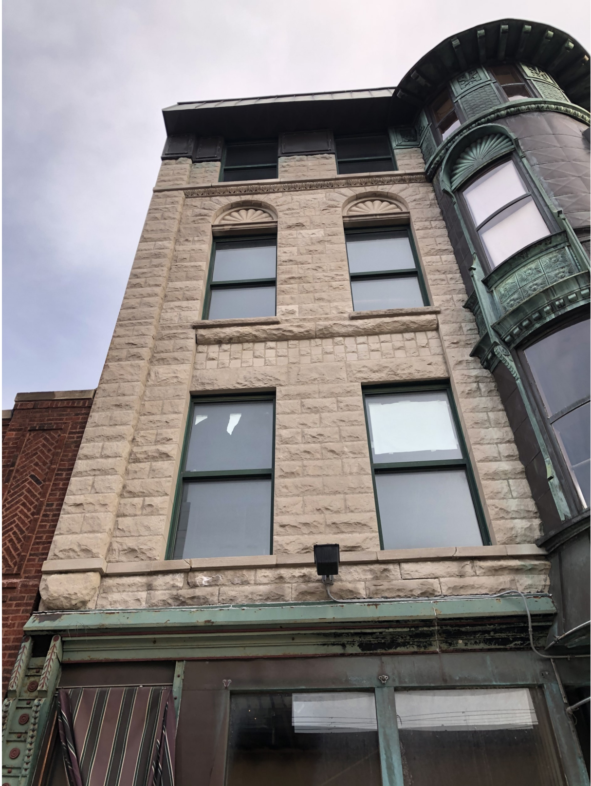
The Lake Street façade incorporates variations in texture, plane, and pattern.