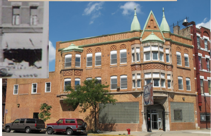
Schlitz Brewery-Tied House at 1870 South Blue Island, built 1899. At left, ca. 1920; at upper right, close-up of entrance, ca. 1920; at bottom right, ca. 2010.