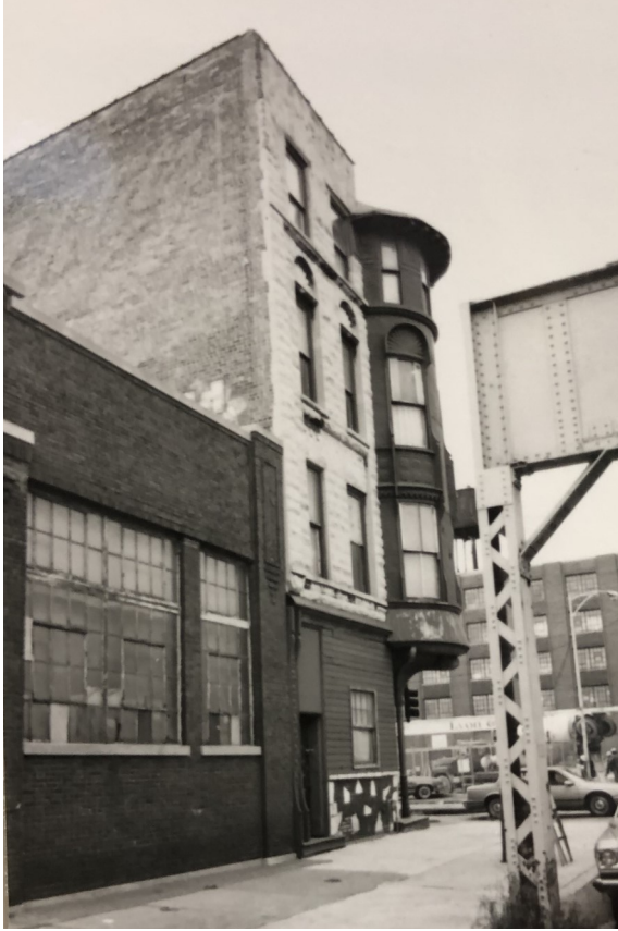
The north (Lake Street) and east (side) elevations of the (Former) Schlitz Brewery-Tied House located at 1393-1399 West Lake Street, 1987. The faded paint of a sign including the trademark Schlitz font logo can be seen on the east elevation.