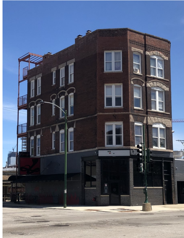
Schlitz Brewery-Tied House at SE corner of Ashland Avenue and Fulton Street, built 1891. At left, ca. 1920; at right, 2021.