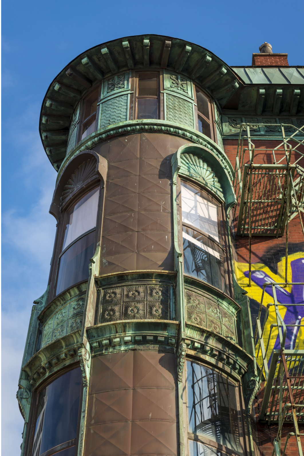
The corner turret of the (Former) Schlitz Brewery-Tied House, 1393-1399 West Lake Street. Replacement panels with a slightly raised "X" pattern are inserted at the second and third floors in between windows, leaving decorative spandrel panels, moldings, and window frames intact. At the third floor, portions of the window frame and the decorative fan lunette above were reproduced to match the existing.