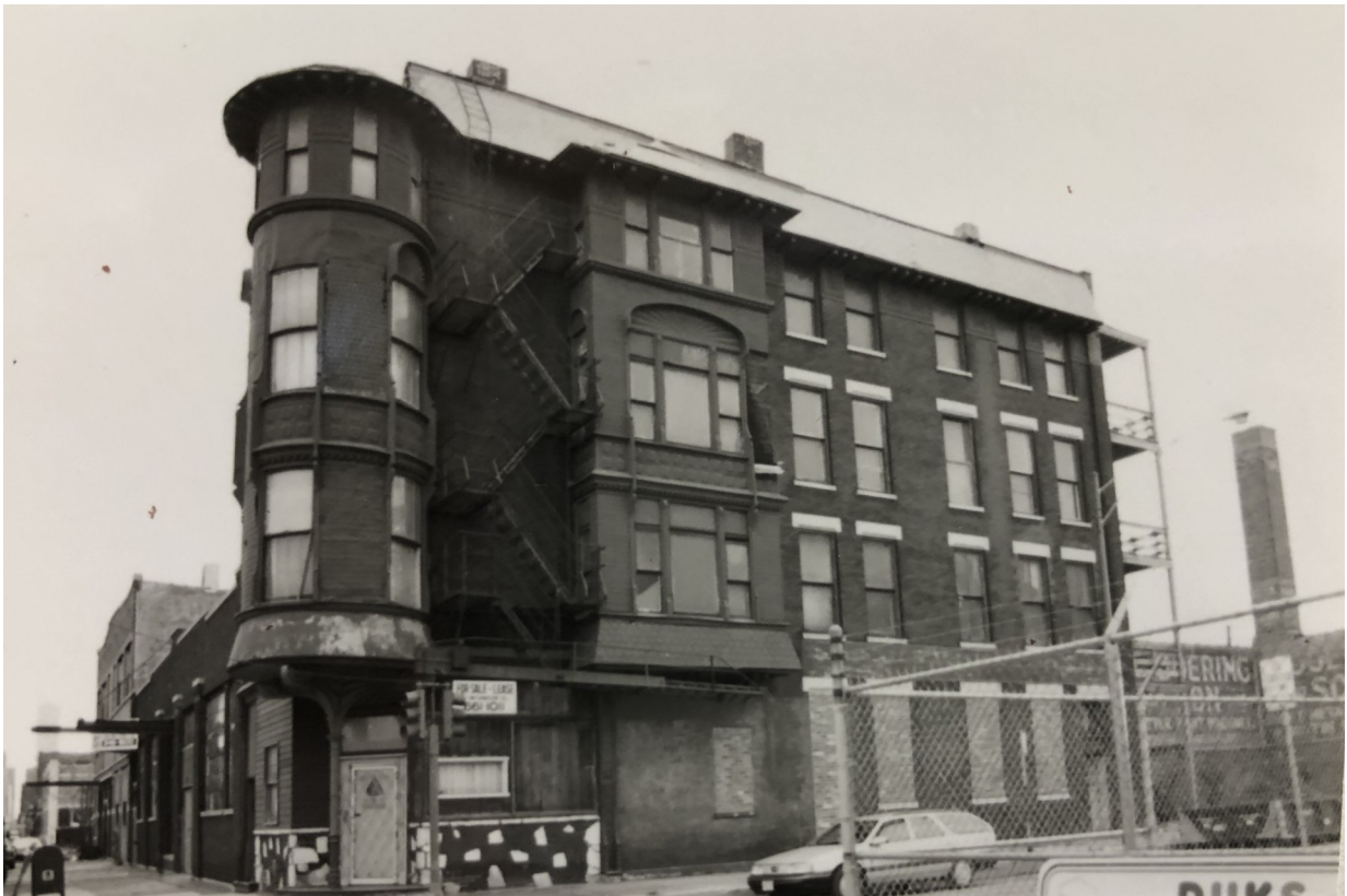
The west/Loomis Street elevation of the (Former) Schlitz Brewery-Tied House located at 1393-1399 West Lake Street, 1987.