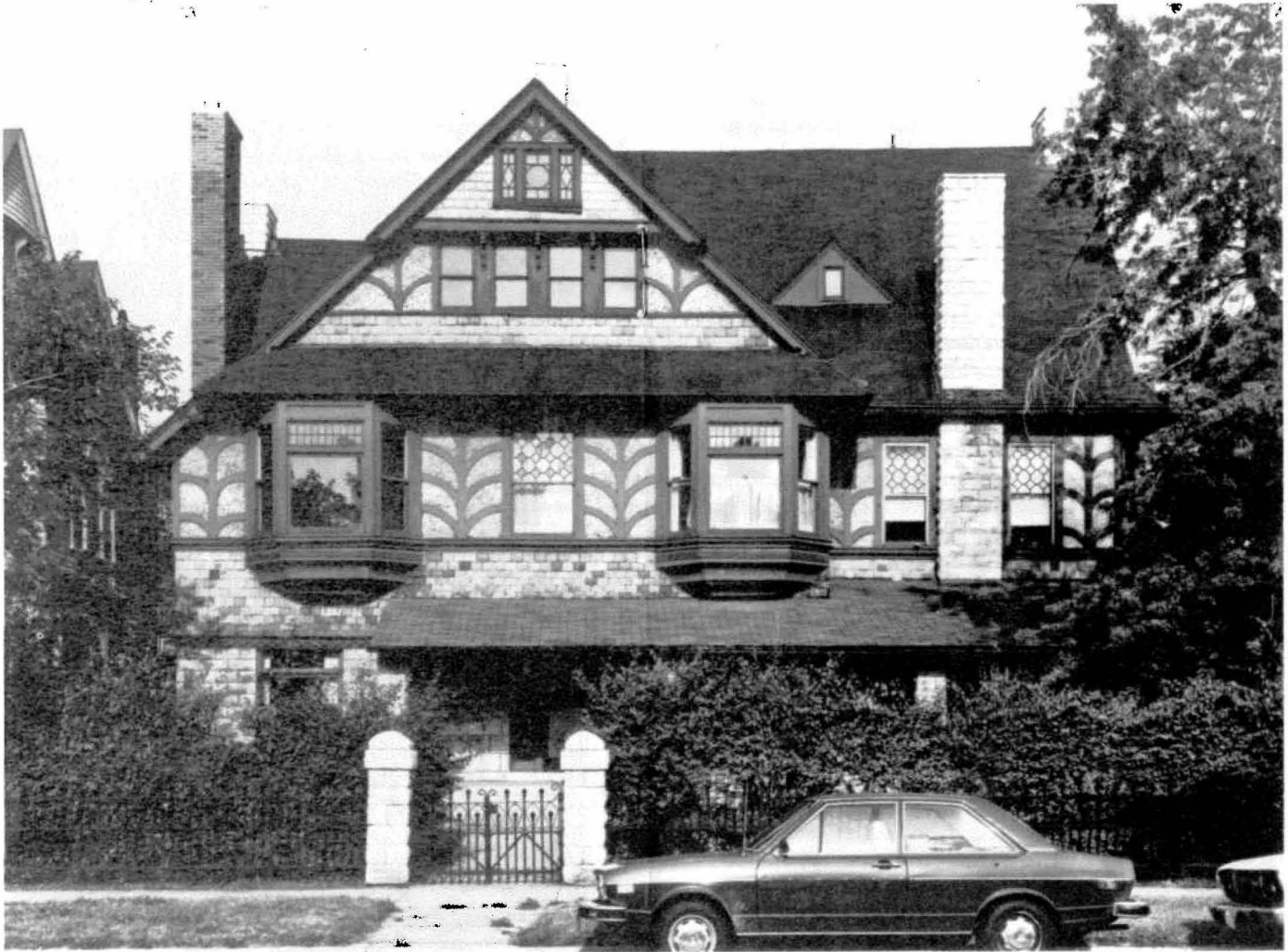
This house at 4800 Kimbark Avenue was built around 1888 and is an excellent example of the Queen Anne style. The facade is arranged more formally than those of most Queen Anne houses. A variety of materials of different colors and textures enlivens the facade, and projections, chimneys, and intersecting roofs create a picturesque composition.

Early in this period, Hyde Park Township experienced governmental problems. The population had grown considerably, and economic differences among the communities began to create difficulties. In addition, the government was rather haphazardly administered, a situation that was dramatically demonstrated in 1878 when the township treasurer, who was a Kenwood resident, admitted that the treasury was short $114,032.62 and he could not account for the money.