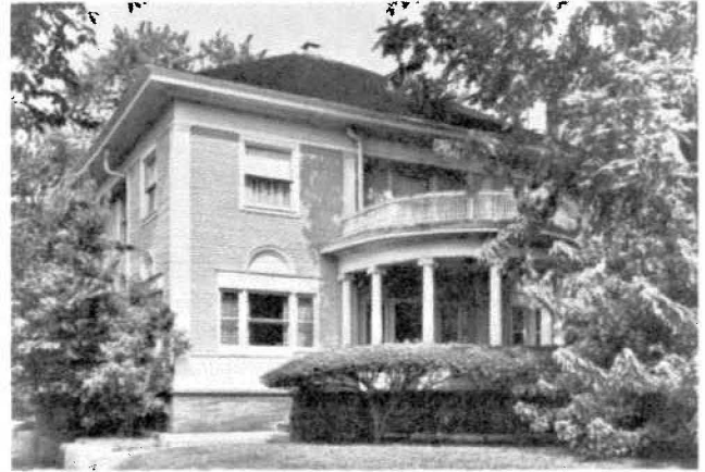
The Blossom House ( above) was designed by Wright in 1892 in the Colonial revival style. Fifteen years later, Wright designed a carriage house ( below) for the Blossoms in the Prairie style that he had developed during the previous decade.

boarding interrupted by flat Doric pilasters. Although these elements of the facade are traditional, there is a horizontal quality to the Blossom House that is unlike other Colonial revival houses. A marked horizontality would later become a primary feature of Wright's work.