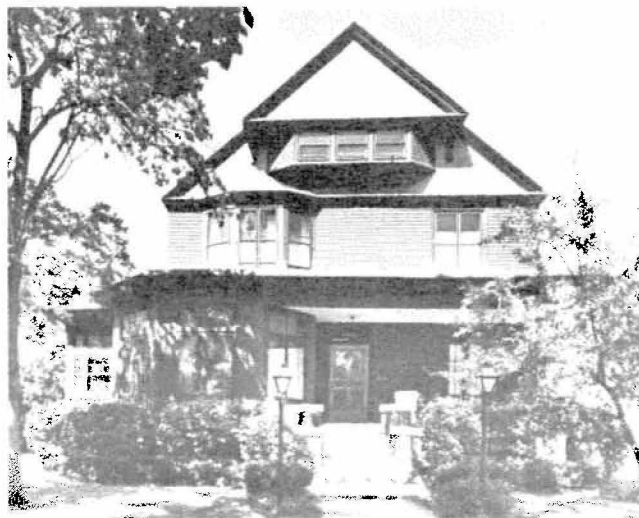
Kenwood has a large concentration of Shingle style houses, such as this one at 4950 Woodlawn Avenue. Its third-floor gables were probably once covered with shingles, as are the two lower floors.