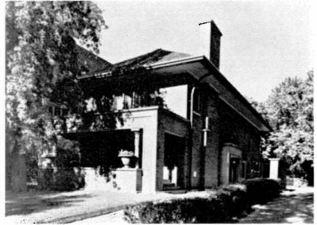
The Magerstadt House (above) is one of Kenwood's finest Prairie school houses. A single decorative motif, the poppy, is used throughout the design of the house. It appears in the columns and original light fixture on the front porch, as shown in the 1963 photograph below.

The major period of Kenwood's development, which had begun around the time of the Columbian Exposition, came to a close by the beginning of the Depression in 1929. By that time, Kenwood had assumed its present physical character. Large, well-built homes set on generous lots with broad and spacious yards defined the suburban nature of the center of the community, and row houses and fine apartment buildings defined its edges.