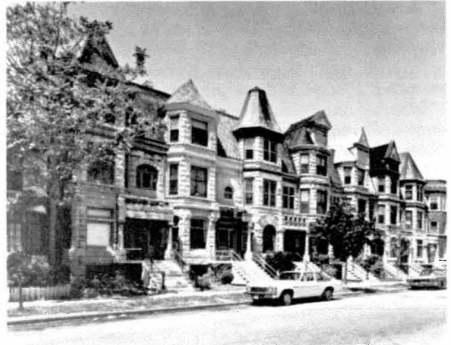
These row houses on Blackstone Avenue were built in 1891. Although row houses and apartment buildings have been built in the community, Kenwood remains suburban in character.