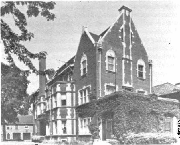
The suburban character of Kenwood derives from the many large houses set on spacious lots, such as the house at 4940 Greenwood Avenue which was designed in the Tudor style.

English architecture of various periods provided American architects with inspiration throughout the second half of the nineteenth century. In addition to the Queen Anne style houses, Kenwood has examples of residences based on the architecture of the period of Elizabeth I and James I. This style, sometimes called Tudor or Jacobethan, had been illustrated in American architectural publications beginning about the middle of the nineteenth century, but was not used in the design of actual buildings until about 1890. The house at 4940 Greenwood Avenue displays many features of this style: a wide rectangular bay window on the south facade; brick walls with decorative stonework, especially on the chimney and around window and door openings; ornamental stone panels set into the tops of chimneys and gables; and intersecting steeply pitched gable roofs.