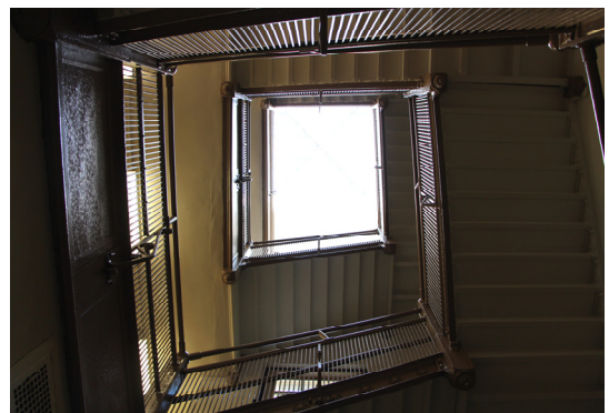
Skylights are another element that are characteristic of Perkins's schools, and they survive at four open stairwells at Trumbull.