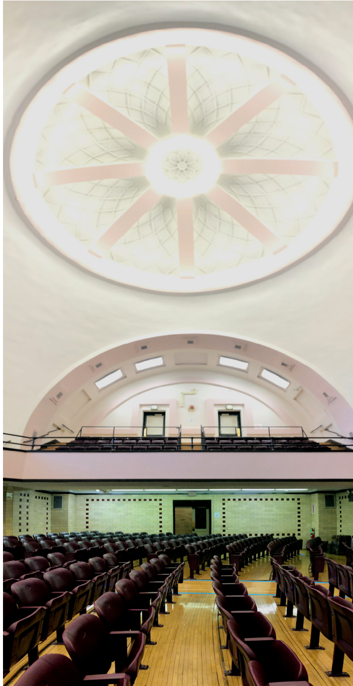
Ground-auditoria were an important part of Dwight Perkin's school designs as he felt these space could be used by neighborhood residents for cultural events, thus maximizing the utility of the school building after school hours. The auditorium at Trumbull features a domed ceiling with pendentives framing the balcony.