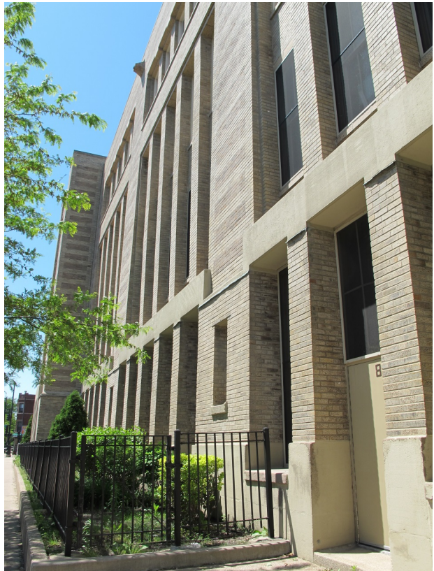
The design of the former Lyman Trumbull Public School Building relies on bold, geometric massing in lieu of traditional architectural ornamentation; the color scheme consists of two-tone brick set in horizontal bands (top). The entrance pavilion (lower left) is framed by projecting towers and surmounted by an entablature with brick set in a geometric pattern. The façade is articulated by deep vertical piers (lower right).