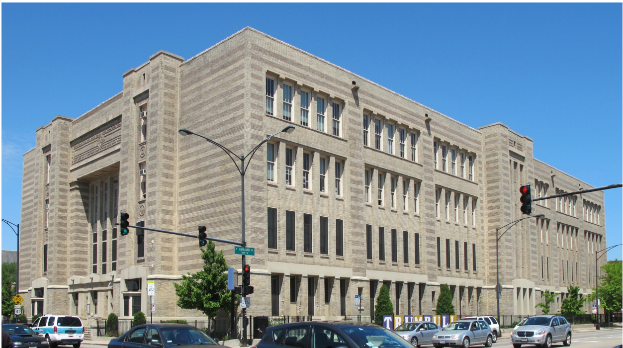
An archival photo of Trumbull (top) from the early-20th century and a current photo shows that the building possesses excellent integrity. The most prominent change is the removal of the pyramidal roofs over the towers.