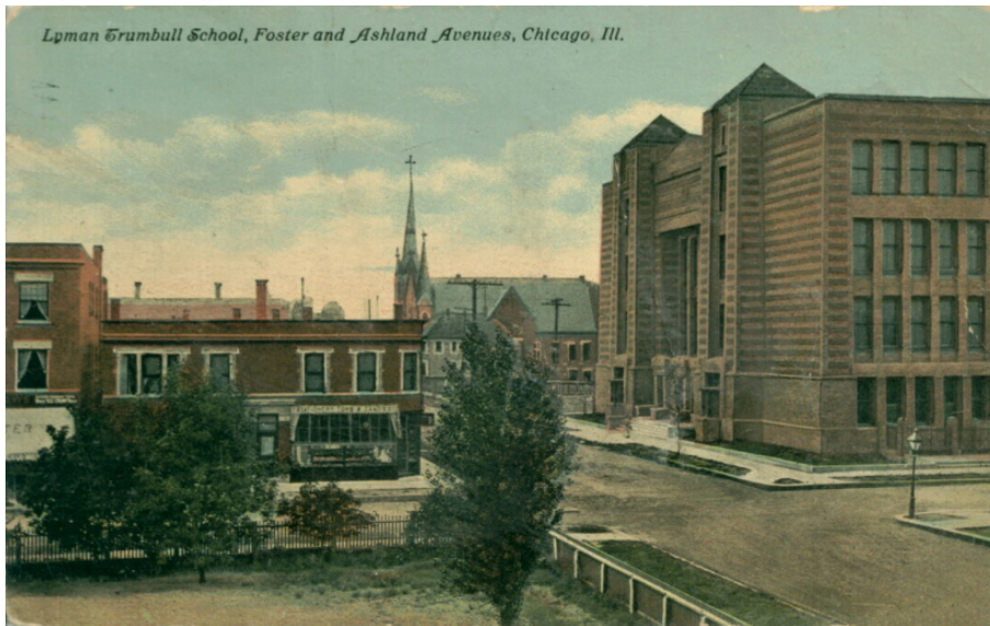
Lyman Trumbull School, Foster and Ashland Avenues, Chicago, Ill.