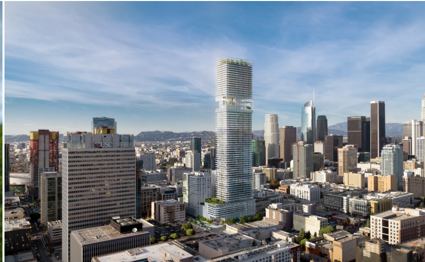
CH's 1045 South Olive Street project in Los Angeles.

One thing I wish would get more attention is “Capping the Kennedy”. This seems like a prime opportunity for the city to be talking to developers and buildings along the Kennedy about a special tax assessment to help fund the project. The entire E-way doesn't need capping, but perhaps every other block.