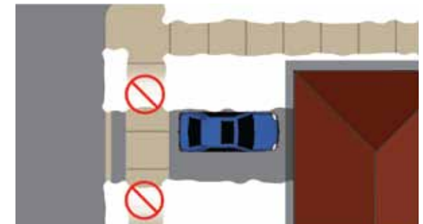
When clearing driveways or walkways do not block the sidewalks with snow.