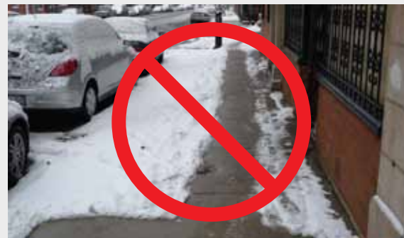
This path does not meet the width required in the Municipal Code.