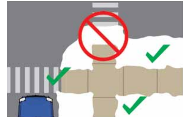
Do not push snow from driveways or sidewalks into the street or over crosswalks.