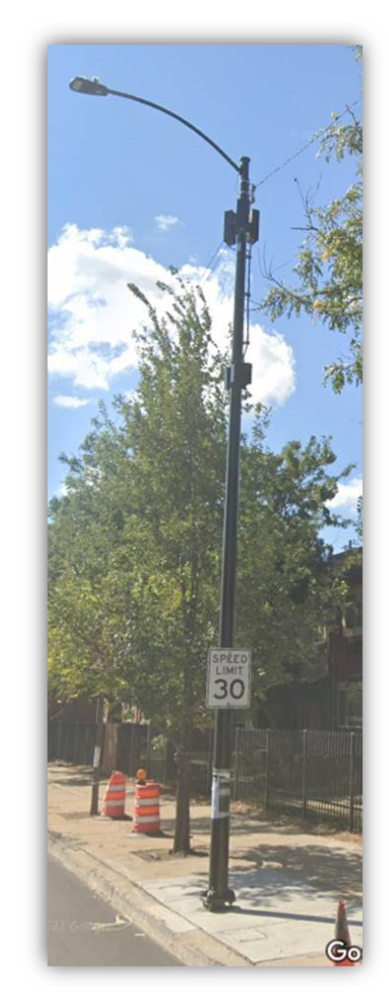
Triangle Radios with Integrated Antennas