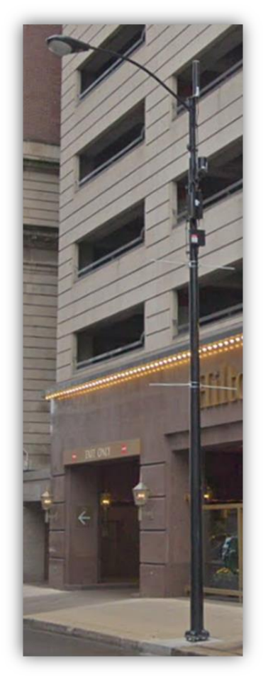
35 Ft. Steel Pole – Anchor Bolt Base [CDOT Spec 808]