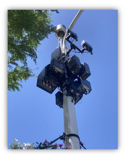
Unshrouded non-concealed equipment, exceeding maximum volume and width, exposed wiring, and no consistent design uniformity