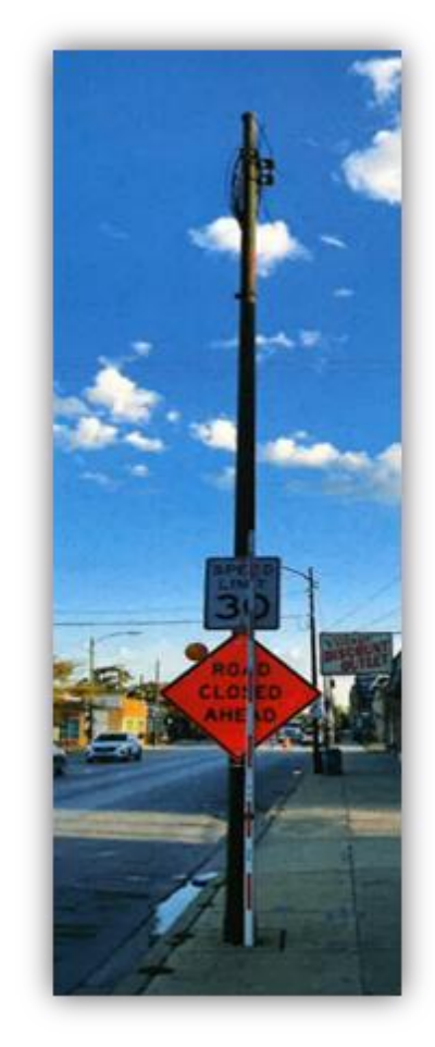
Legacy Streetcar System Span Pole [This type of steel pole is being phased out, Replacement pole: CDOT Spec 808]