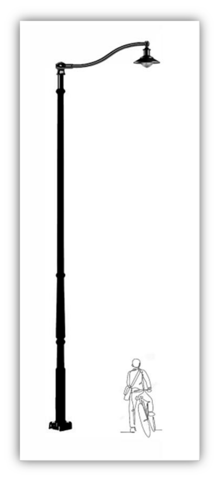
Boulevard Pole [CDOT Spec 976]