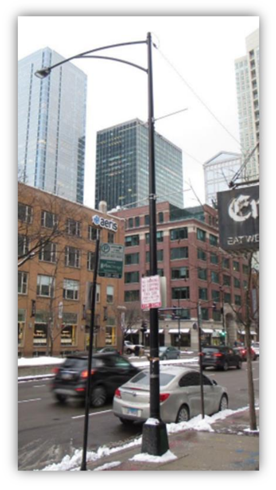
31' Ballast Housing Base Pole [This type of steel pole is being phased out, Replacement pole CDOT Spec 808]