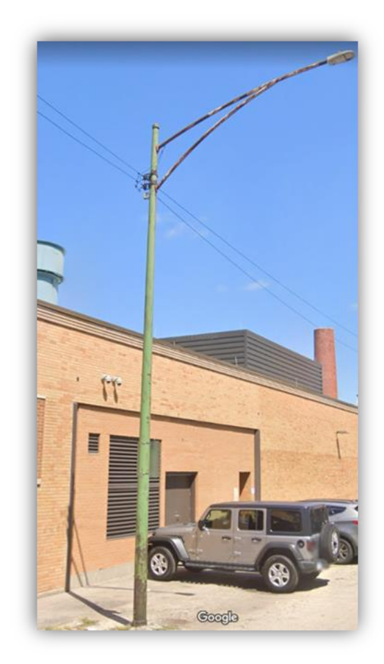
Legacy Streetcar System Span Pole [This type of steel pole is being phased out, Replacement pole: CDOT Spec 808]