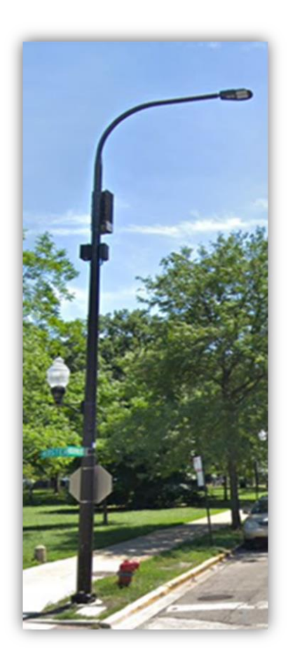
35 Ft. Anodized Davit [CDOT Spec 971 Anodized]