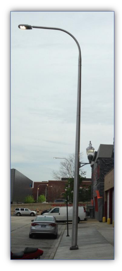
35 Ft. Aluminum Davit [CDOT Spec 971]