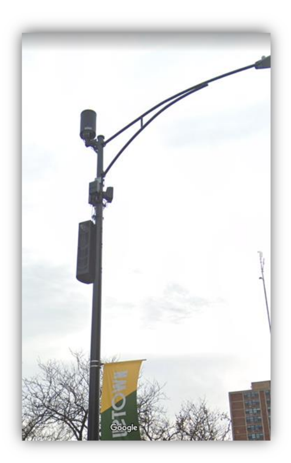
Canister Antenna with Shrouded Equipment Cabinet