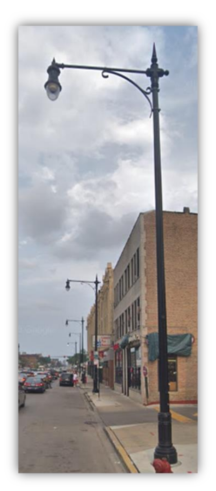
32 Ft. Chicago Gateway 2000 [CDOT Spec 930]