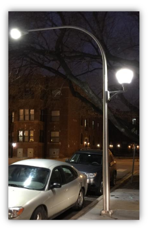
20 Ft. Steel Legacy Residential Light Pole [This type of steel pole is being phased out, Replacement pole: CDOT Spec 808]