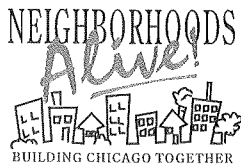
Christine Raguso Acting Commissioner