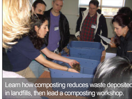
Learn how composting reduces waste deposited in landfills, then lead a composting workshop.