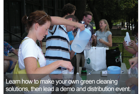
Learn how to make your own green cleaning solutions, then lead a demo and distribution event.

topics include: water • land air • energy • community engagement and more!