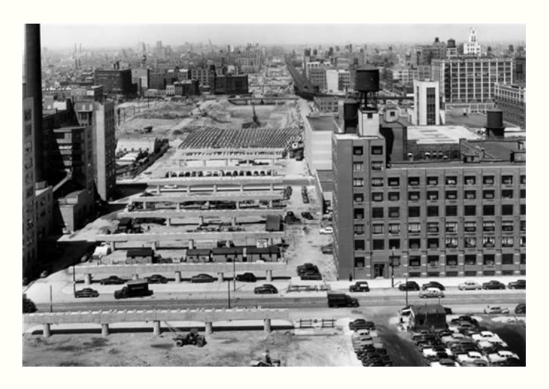
Congress Parkway construction, 1920s