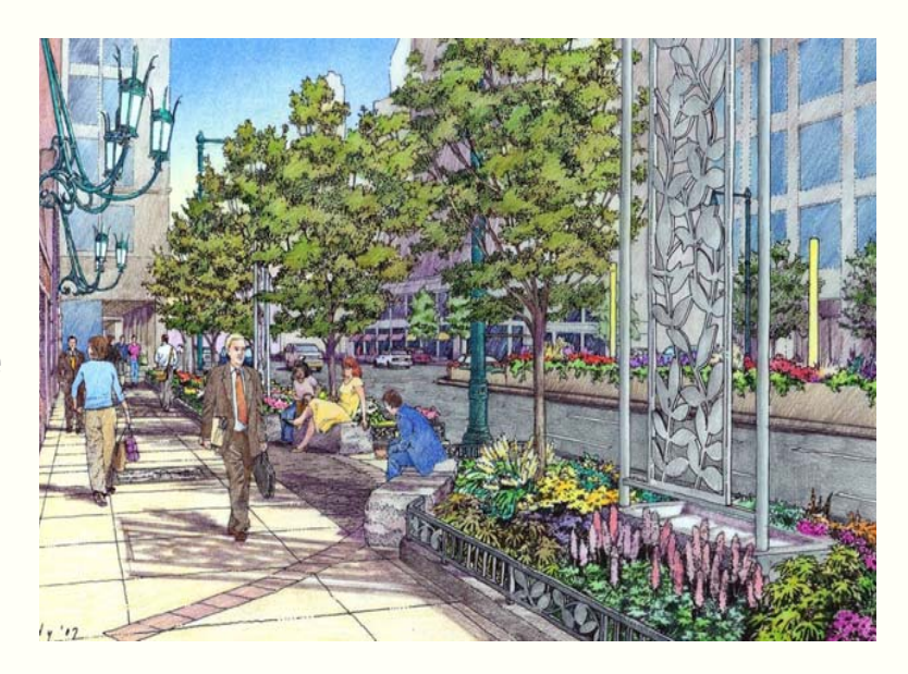
Sidewalk planter with gateway element