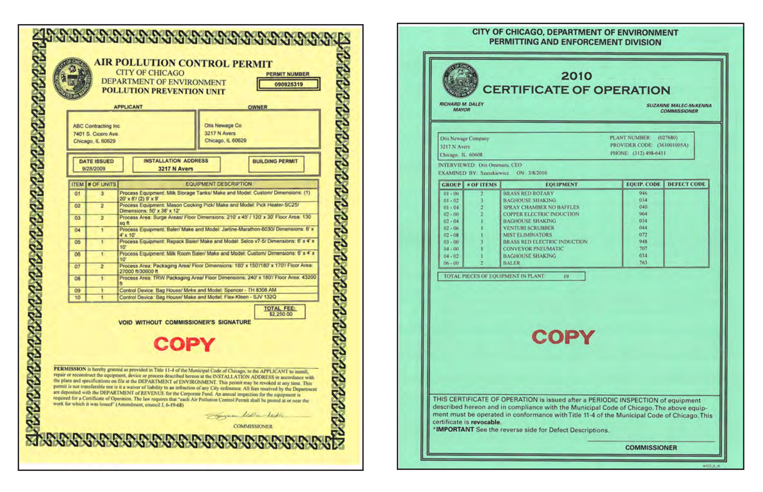
Air Pollution Control Permit and Certificate of Operation

Your APC permit is valid for the life of the equipment at its current location. However, if you replace the equipment, relocate it to another facility, or modify it such that the quantity or nature of air contaminants changes, you must obtain a new APC permit. (Please note that Certificates of Operation must be renewed annually.)