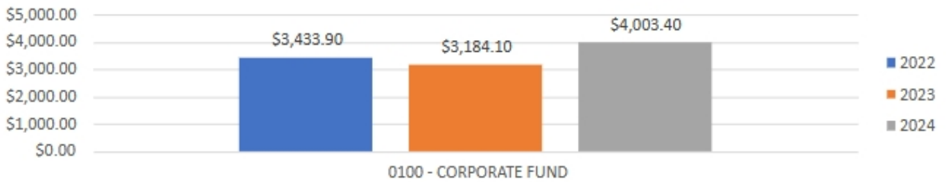
Funding Type by Year