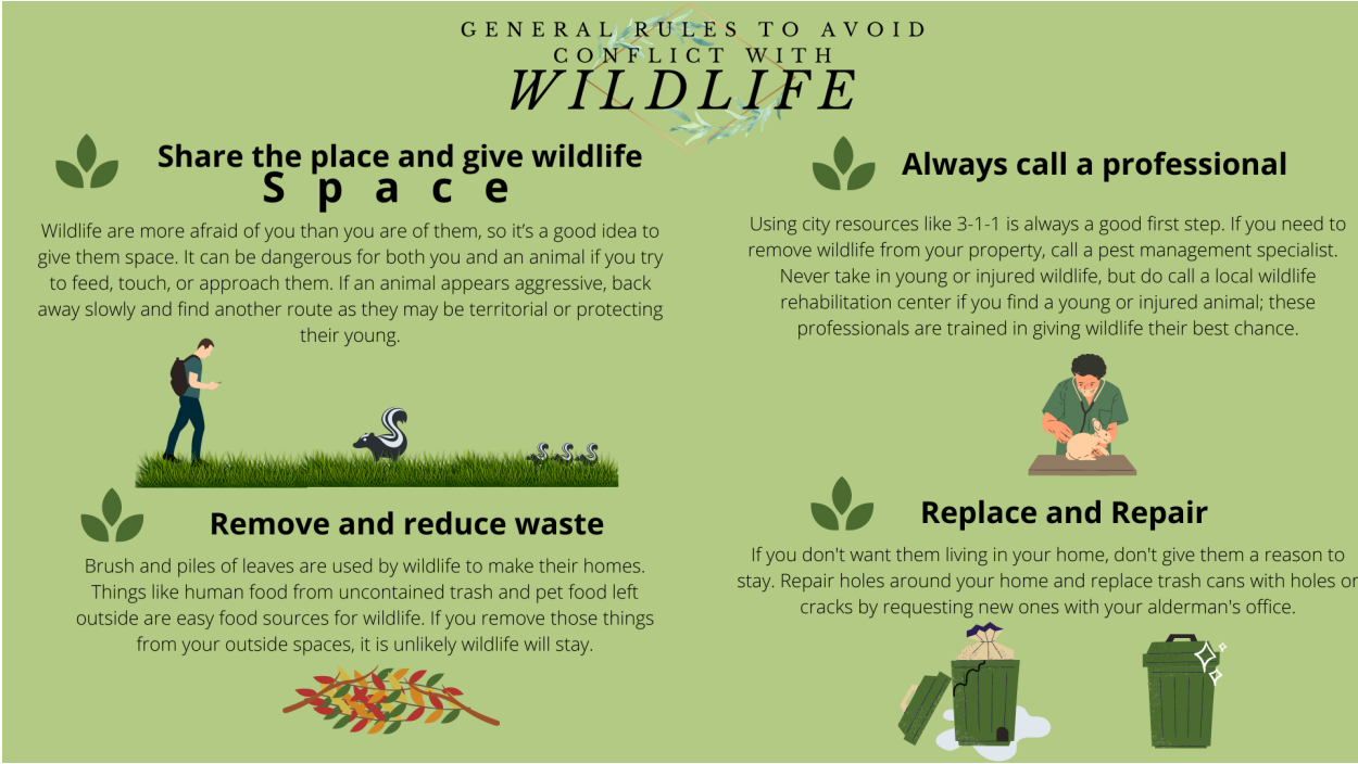
Figure 16 Lincoln Park Zoo, Urban Wildlife Institute

Chicago is a unique city, home to many forms of wildlife. Understanding how to cohabitate with these creatures is necessary to drive coexistence. Appropriately navigating direct encounters and avoiding potentially negative future events is, therefore, crucial. Some helpful rules include: giving animals space when you see them, eliminating waste and repairing damage on your property, and contacting professionals in cases of wildlife related problems. Local wildlife offer opportunities to experience nature in the city and understanding how to share space will ensure that we promote positive interactions.