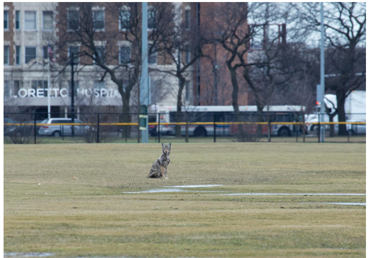
Lincoln Park Zoo Urban Wildlife Institute

The vast majority of coyotes in urban areas never create conflict with humans. They do pose a risk to outdoor cats, and can put motorists at risk as they cross roadways. On rare occasions, coyotes can attack humans, and there has been one documented human attack in the city of Chicago in January, 2020. This was an isolated incident of human-coyote conflict followed by swift action on the part of ACC and partnering agencies resulting in the ultimate capture of the coyote. These events are often precipitated by inappropriate contact with humans, such as both intentional and unintentional human feeding. Coyotes can also harbor diseases and parasites of public health concern such as rabies, tularemia, and the tapeworm Echinococcus multilocularis , which is spread through coyote feces and can be fatal if left untreated. Several coyote parasites and diseases can be transmitted to domestic dogs such as canine distemper, canine hepatitis, and sarcoptic mange.