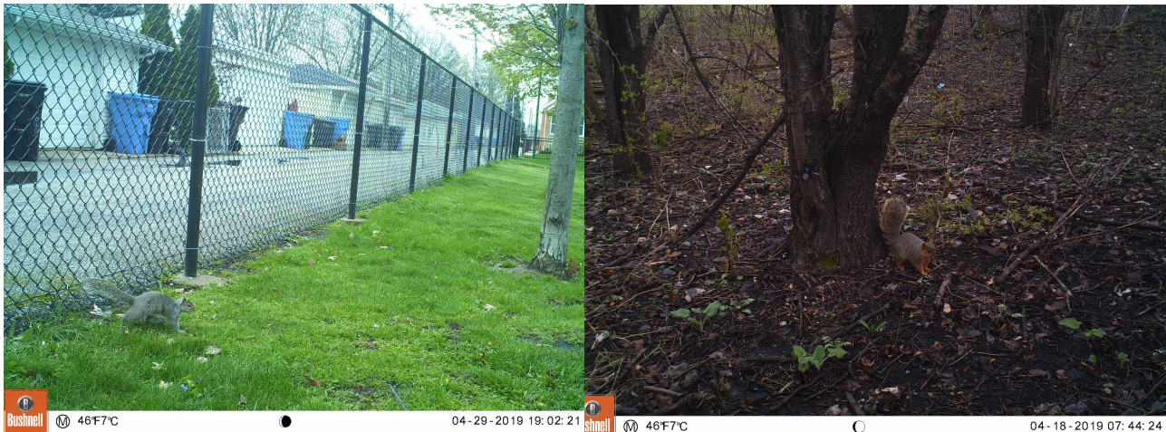
Lincoln Park Zoo Urban Wildlife Institute

There are over 200 species of squirrel across the globe, though Chicago is home to two common North American species: the eastern gray squirrel and the fox squirrel. These squirrels have overlapping native ranges, and are particularly common in the eastern part of the United States. Although both exhibit variation in their appearance, there are notable differences that can help an