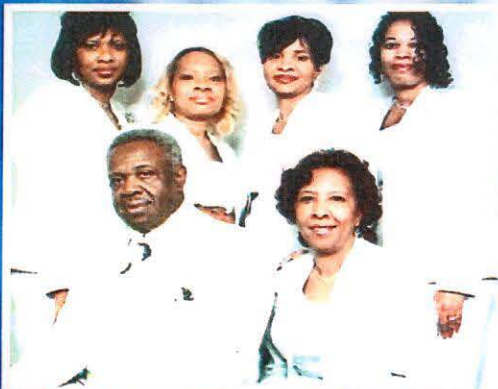
THE MIXON SINGERS