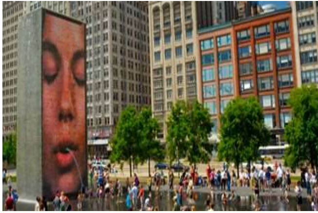
5. Crown Fountain, Jaume Plensa