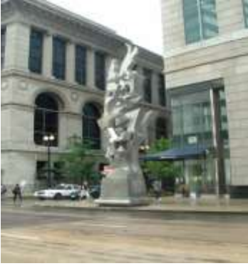
1. 'We Will', Richard Hunt