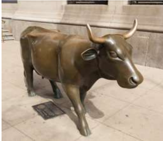
6. Bronze Cow