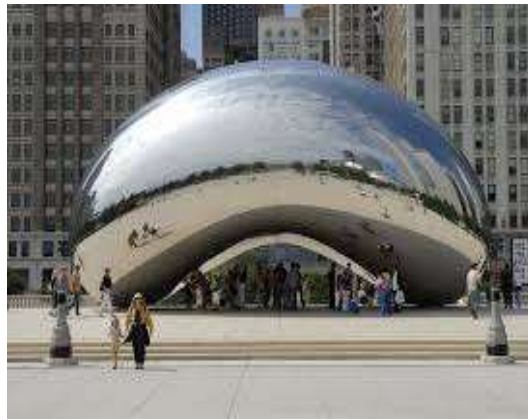
3. Cloud Gate, Anish Kapoor