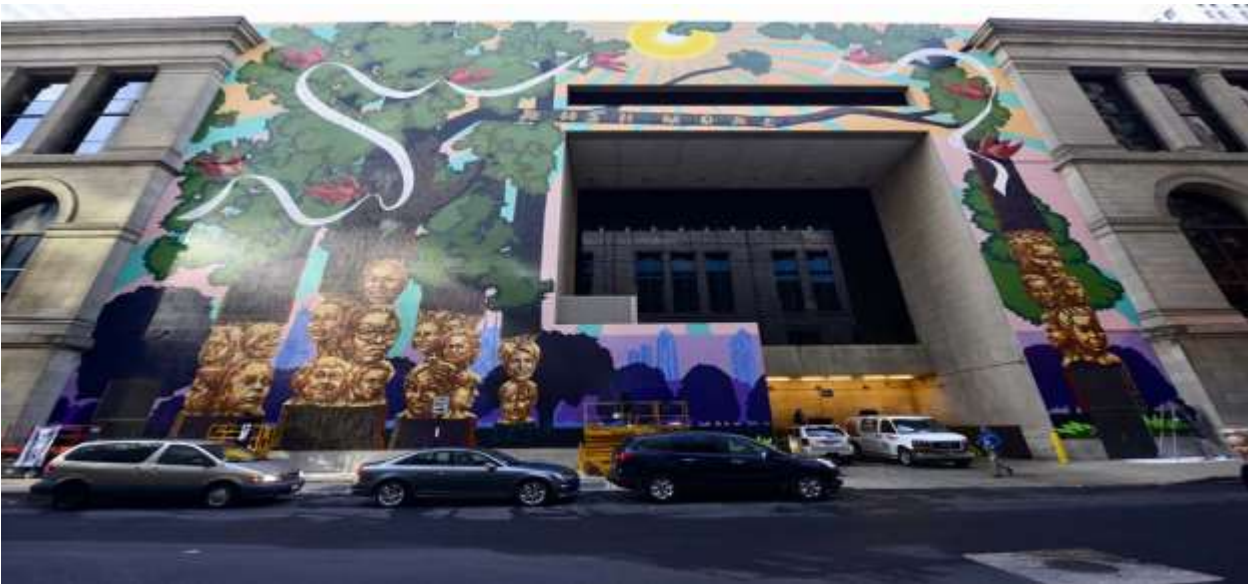
7. Rushmore, Kerry James Marshall