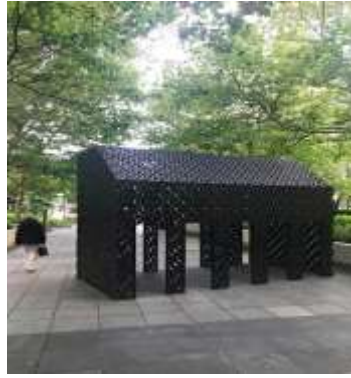
2. 'Screenhouse', Edra Soto