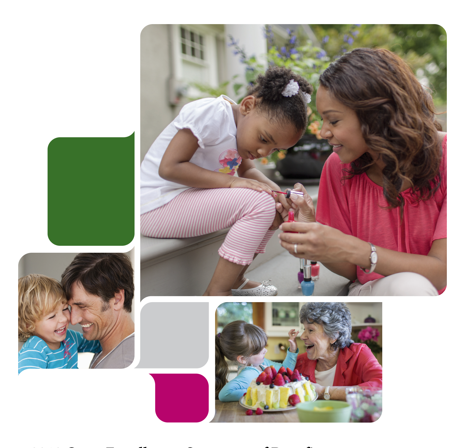
2019 Open Enrollment Summary of Benefits Chicago Park District Dental