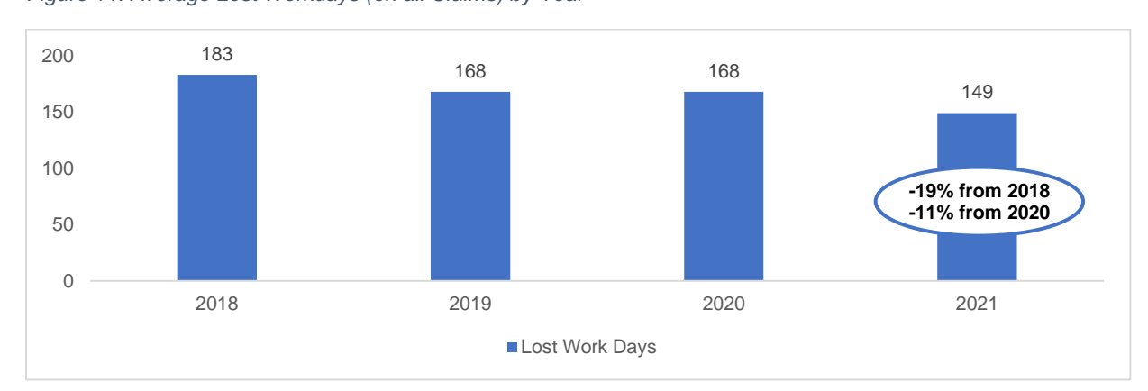
Figure 11: Average Lost Workdays (on all Claims) by Year

These results were driven by claim practice improvements and enhancements to the return-to-work program. Claims handling practices were modernized and professionally administered by experienced financial managers dedicated to reducing costs. In April of 2021, DOF developed and launched a Transitional Duty Work Program. This program offers employees the opportunity to gradually transition back to work, allowing them the chance to work in a modified capacity based on their work restrictions. In the first 8 months of the Transitional Duty Work Program (through December 2021), employees who otherwise would have remained off work were successfully placed into positions that could accommodate their work restrictions.