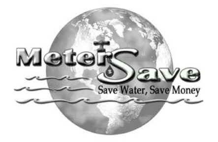
Save Water Save Money!

Please go to <u>www.metersave.org</u> By phone call 3-1-1, or 312-744-4H2O.